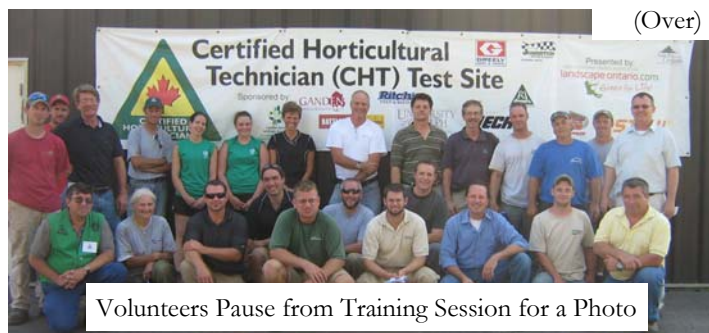
Volunteers Pause from Training Session for a Photo